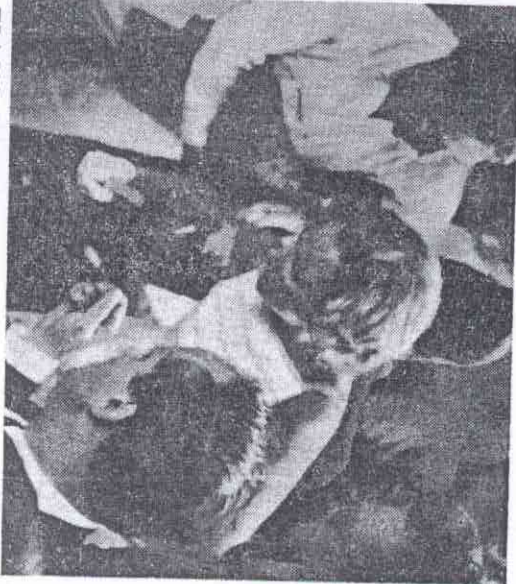
TRAGIC MOMENT: Seconds after the shooting, Ethel Kennedy (above) pushes to the front of the crowd and looks down in anguish at her bodily wounded husband, Senator Robert Kennedy (photo left).

ed on a single individual in almost an identical pattern. "But I don't think it makes any sense to ignore the possibility of a conspiracy," he said. "I still say my client may be a very important witness in proving that all three killings are linked. And as an attorney who has handled many im-