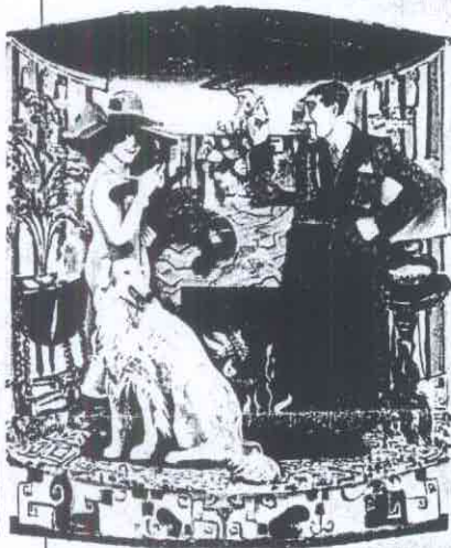
© 1993 Red Grooms/ARS, New York

A bilingual record of American history with pictures that illustrate major themes in the country's life and bloodstream is the concept behind American Highlights/Los Estados Unidos: United States History in Notable Works of Art/Grandes Momentos en su Historia a Través de Prominentes Obras de Arte, by Edith Pavese, published this month by Abrams ($29.95). All of the text appears in both English and Spanish. Shown here: Red Grooms's wood construction Somewhere in Beverly Hills/En algún lugar de Beverly Hills (1966-67). Abrams plans to direct the book largely to the educational market, and to follow up with Japanese, French, German and Russian in place of the Spanish.