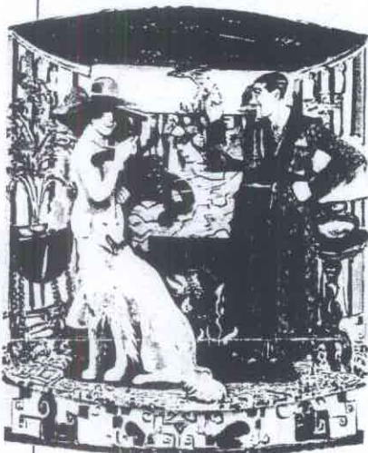
© 1993 Red Grooms/ARS, New York

A bilingual record of American history with pictures that illustrate major themes in the country's life and bloodstream is the concept behind American Highlights/Los Estados Unidos: United States History in Notable Works of Art/Grandes Momentos en su Historia a Través de Prominentes Obras de Arte, by Edith Pavese, published this month by Abrams ($29.95). All of the text appears in both English and Spanish. Shown here: Red Grooms's wood construction Somewhere in Beverly Hills/En algún lugar de Beverly Hills (1966-67). Abrams plans to direct the book largely to the educational market, and to follow up with Japanese, French, German and Russian in place of the Spanish.