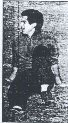
NOW: JFK Jr. relaxes on the Great Lawn in Central Park after a game of touch football.

"Of Bobby's 11 children, 10 are still living. A daughter, Kerry Kennedy Cuomo — she's married to Andrew Cuomo — runs the Robert F. Kennedy Human Rights Center, and