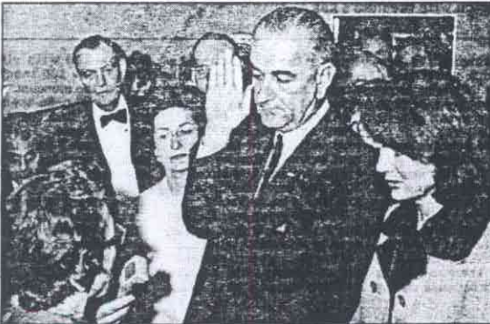
THEN: Still wearing the pink suit she had on when her husband was slain, Jacqueline Kennedy looks on as Lyndon B. Johnson is sworn in as President.