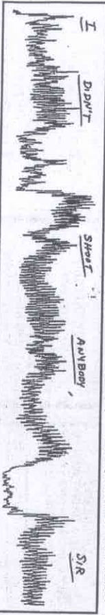
VOICE PATTERNS clearly show that Oswald was telling the truth, says expert.