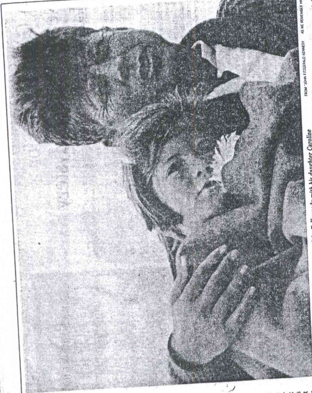
FROM "JOHN FITZGERALD KENNEDY AS WE REMEMBER HIM"

That much was known on Nov. 22, 1963. However, any one of several things now known would have, if revealed in 1963 or at any point during the later life of a non-assassinated John F. Kennedy, ended the Kennedy presidency and left the ex-president with a historical reputation inferior to that of Richard M. Nixon, among others. The two most damaging examples will suffice. Revelations of any part of the Kennedy-supported CIA assassination plots targeted at Cuba's Fidel Castro likely would have had as severe a contemporaneous political impact as Watergate had on the Nixon presidency or the Iran-contra scandals have had on Reagan's. Second, even if the Mafia's extensive involvement in those government-sponsored plots had not on its own been enough to generate calls for impeachment or resignation, revelation of an incumbent president's extensive sexual involvement with a top hoodlum's girlfriend—Sam Giancana's Judith Campbell—certainly would have looked at with the cold retrospective eyes of history, the assassination in Dallas may well have saved John Kennedy from a