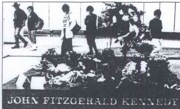
Marking the day in Dallas: Still 'a special place' in the nation's heart