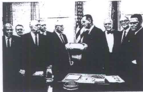
UNITED PRESS INTERNATIONAL