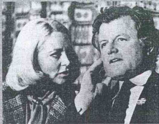
A remarriage may be just around the corner for Ted and Joan, say friends

"Ted is still worried about Joan's condition," another source says. "She has come out of the deep depression she suffered after her arrest.