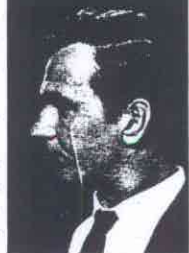
Oldman as Oswald