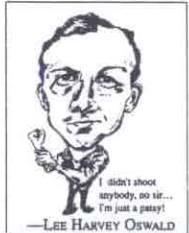
—LEE HARVEY OSWALD