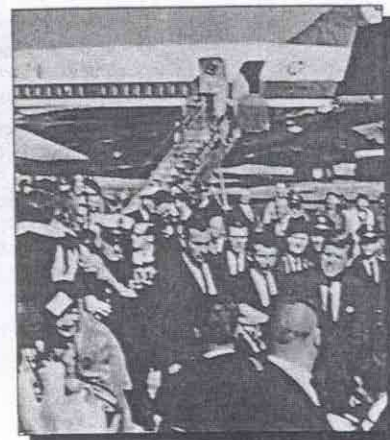
AT LOVE FIELD