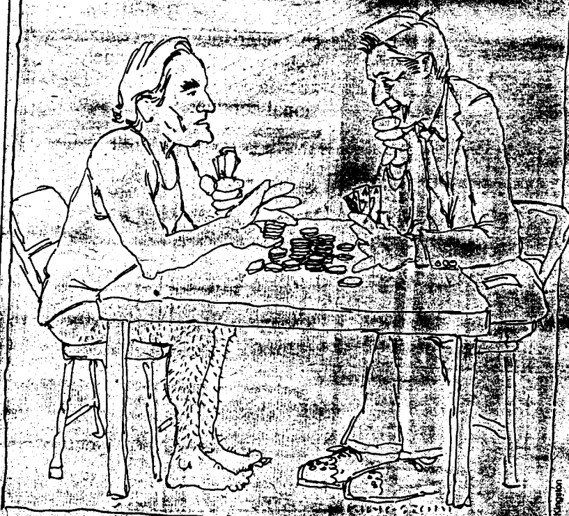
"I'll see your cap on taxes and raise you by a $138 million welfare cut."