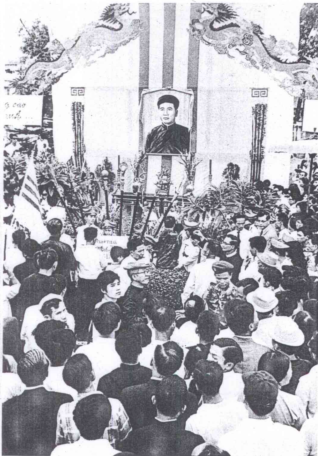
Rehabilitation. In Saigon last November, Diemists gather before a portrait of their lost leader at the first such memorial permitted by the present regime. Had Diem not been overthrown, some South Vietnamese and American observers now ask privately, could things have been any worse?