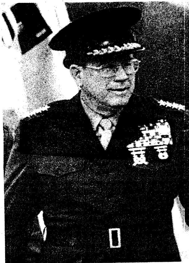
General Robert E. Cushman

A. It was supposed to require judgment by the district