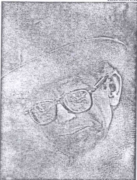
FORMER COUNTERINTELLIGENCE CHIEF ANGLETON A passion for anonymity.

His son's familiarity with high cuisine, wine and good tailoring was thus all naturally acquired. So too was his