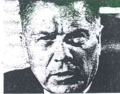
During Camelot, members of the Justice Department disliked Teamsters boss James Hoffa so much they leaked the news that he was arrested for beating up an aide even before the police reports were typed.

name, even though the statement involved him, too, in apparently criminal activities.