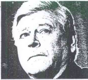
Consider the source. Even as Jack Anderson's right-hand man stood charged with possession of stolen Interior Department papers, Secretary Rogers C. B. Morton slipped a few internal memos to Anderson.