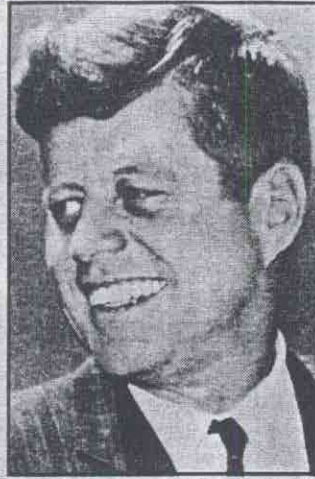
JFK'S version of his death differs from Warren Commission's conclusions

behind a fence on the grassy knoll up which police officers raced immediately following the shooting. It wasn't until later, however, that agents inspected the manhole and found that it led to the sewer system that runs under Dealey Plaza.