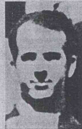
THE REAL OSWALD before he went to Russia. Experts point out facial differences between him and assassin.

the Oswald file... but they kept track of him," he claims. "The last word I had was that he was married, had a couple of kids — a boy and