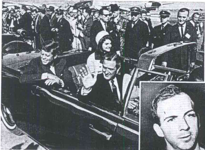
The Kennedys and Texas Governor Connally in Dallas before the assassination. Question that will not die is whether Lee Harvey Oswald, right, acted alone in shooting.