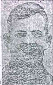
LEE HARVEY OSWALD

"At the age of 15," he adds, "after watching the way workers are treated in New York, and Negroes in the South, I was looking for a key to my