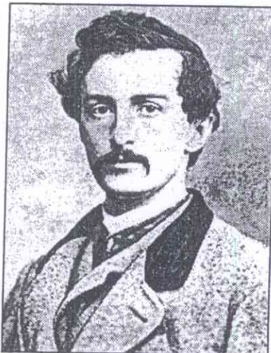
BOOTH: Shot President Lincoln at Ford's Theater in Washington, D.C.