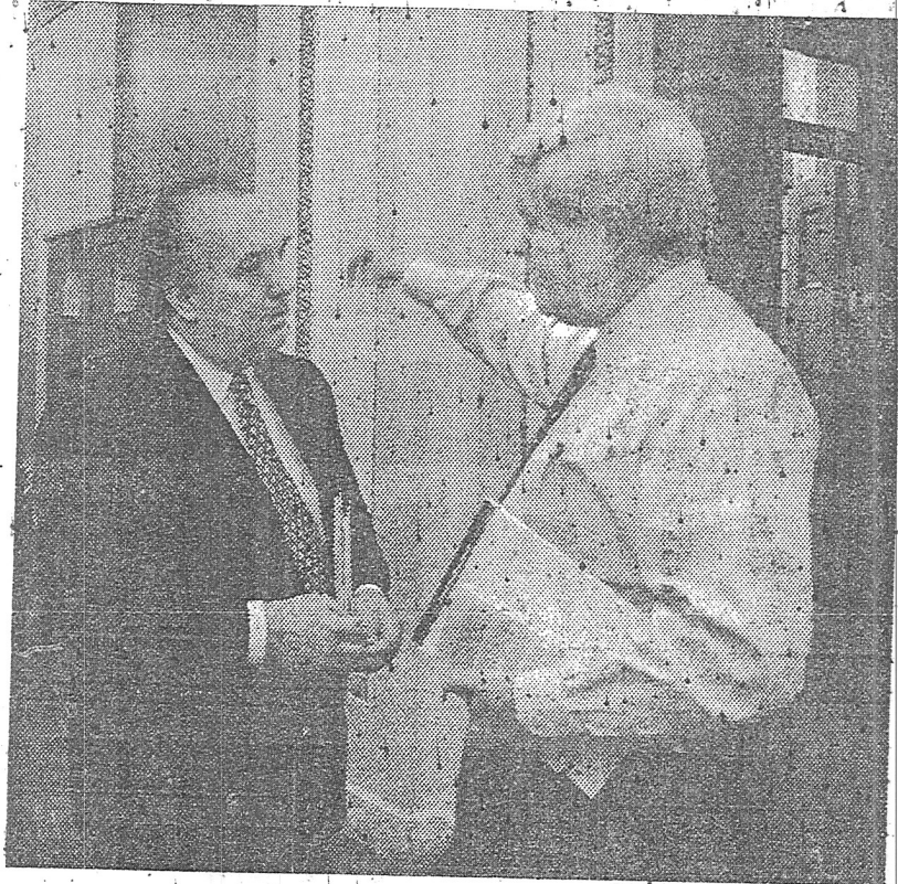
House Speaker Newt Gingrich confers with Michigan Gov. John Engler.