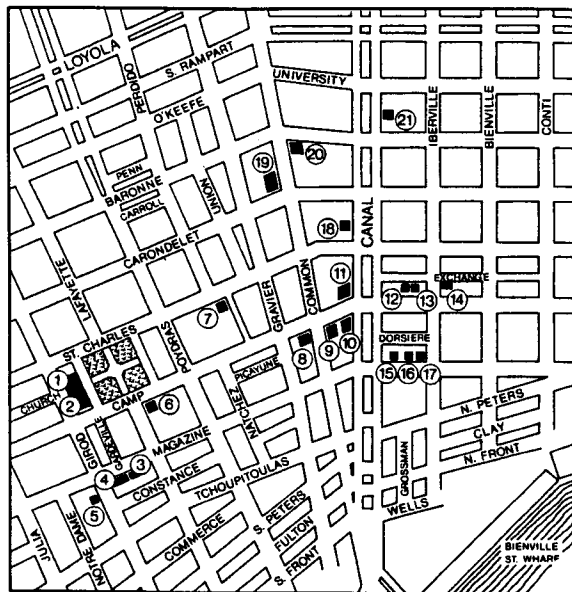
Map 4. Places Associated with Oswald in New Orleans