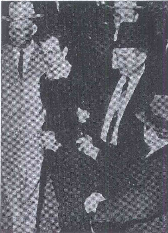
The shooting of Oswald.