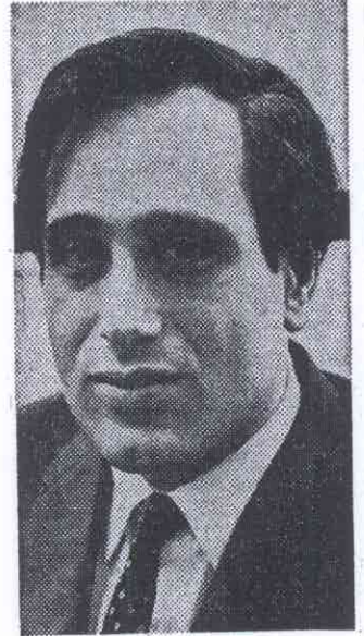
EDWARD JAY EPSTEIN

was to discover how the Warren Commission operated—how it organized its work, how it conceived of its function, what limits it set to its investigation, and how it selected from the mass of conflicting evidence those details on which it based its findings.