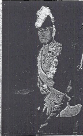
BARON GENERAL GIICHI TANAKA and his entire cabinet drew up the infamous Tanaka Memorial—Japan's Mein Kampf —when he was Premier in 1927. Since then, the rulers of Japan have followed his plan to the very letter.