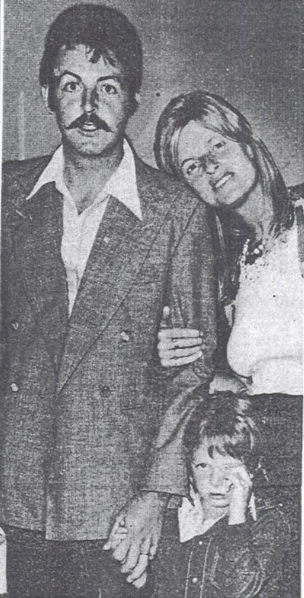
IT WAS a close shave, but rock star Paul McCartney managed to save his handlebar mustache. "I took my beard off," he said as he flew into London airport with his wife Linda and daughter Mary, 6. "But I'm keeping the mustache. I think I'll have it properly waxed — and become a saloon-keeper," he joked.