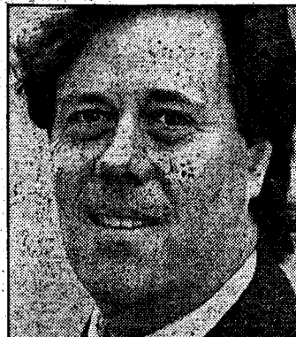
DAVID MARANISS ... for chronicle of candidate Clinton