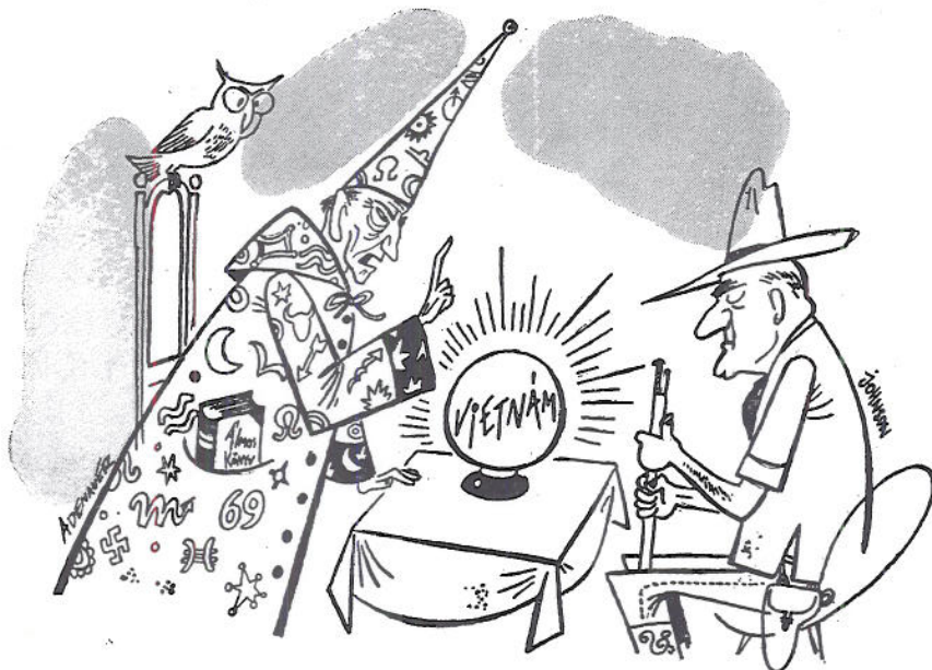
As Budapest's Ludas Matyi sees Vietnam.

The Fortune Teller: "You know what the stars say? Quit!"