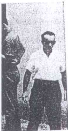
1 August 1963. There is e operation to establish er of Fidel Castro. This onspirators knew about where the assassination