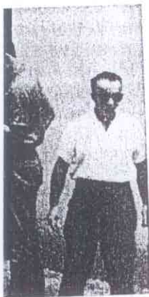
1 August 1963. There is e operation to establish er of Fidel Castro. This onspirators knew about where the assassination