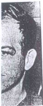
Orleans, who was un-