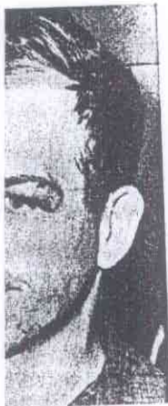
Orleans, who was un-