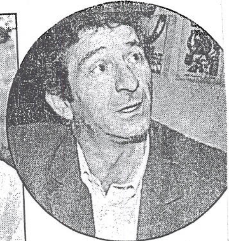
Who killed the truth over Kennedy's death? Peter Sissons, left, protested about 'whitewash' after a

mission, Central was accused of fantasy and distortion. A team of its own reporters and researchers, sent to France to recheck the story, told the Midlands-based company that the allegations were "total nonsense" dreamt up by an "amateurish" American author from underworld gossip.