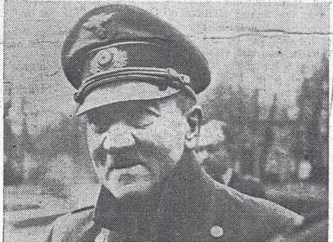
A frame from a roll of film marked "Last Pictures of Hitler," found in the files of Heinrich Hoffmann, the Führer's official photographer, when the Russians entered Berlin.