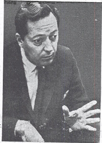
Mr. Jim Garrison, the New Orleans District Attorney.

He has sent men into the night haunts of the French quarter to straighten out morals, and he also had a prolonged battle with New Orleans judges, whom he accused of being work-shy. He was acquitted by the state Supreme Court