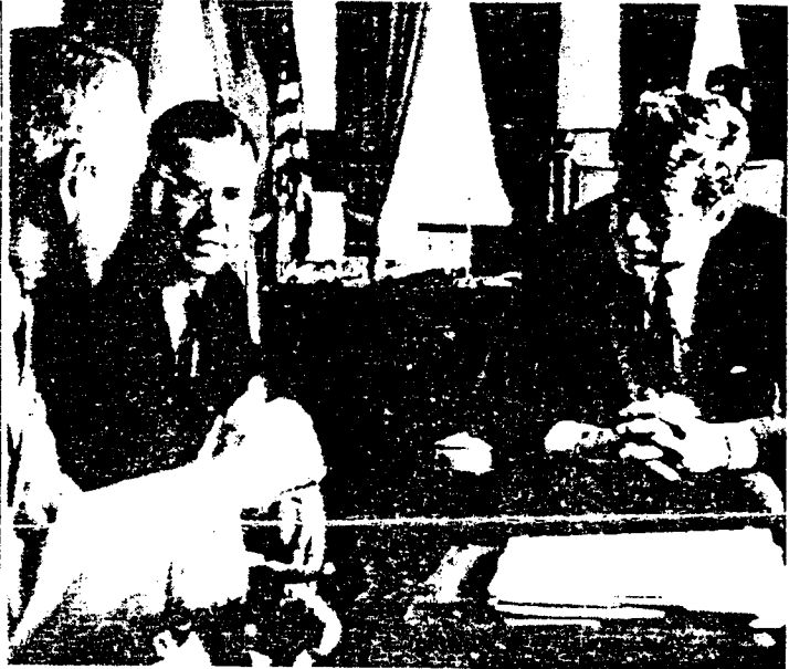
President Kennedy gets a firsthand report on the situation in the Republic of Vietnam from General Maxwell D. Taylor (left), chairman of the Joint Chiefs of Staff, and Defense Secretary Robert McNamara.

Tracing the history of the syndicate known as La Cosa Nostra,