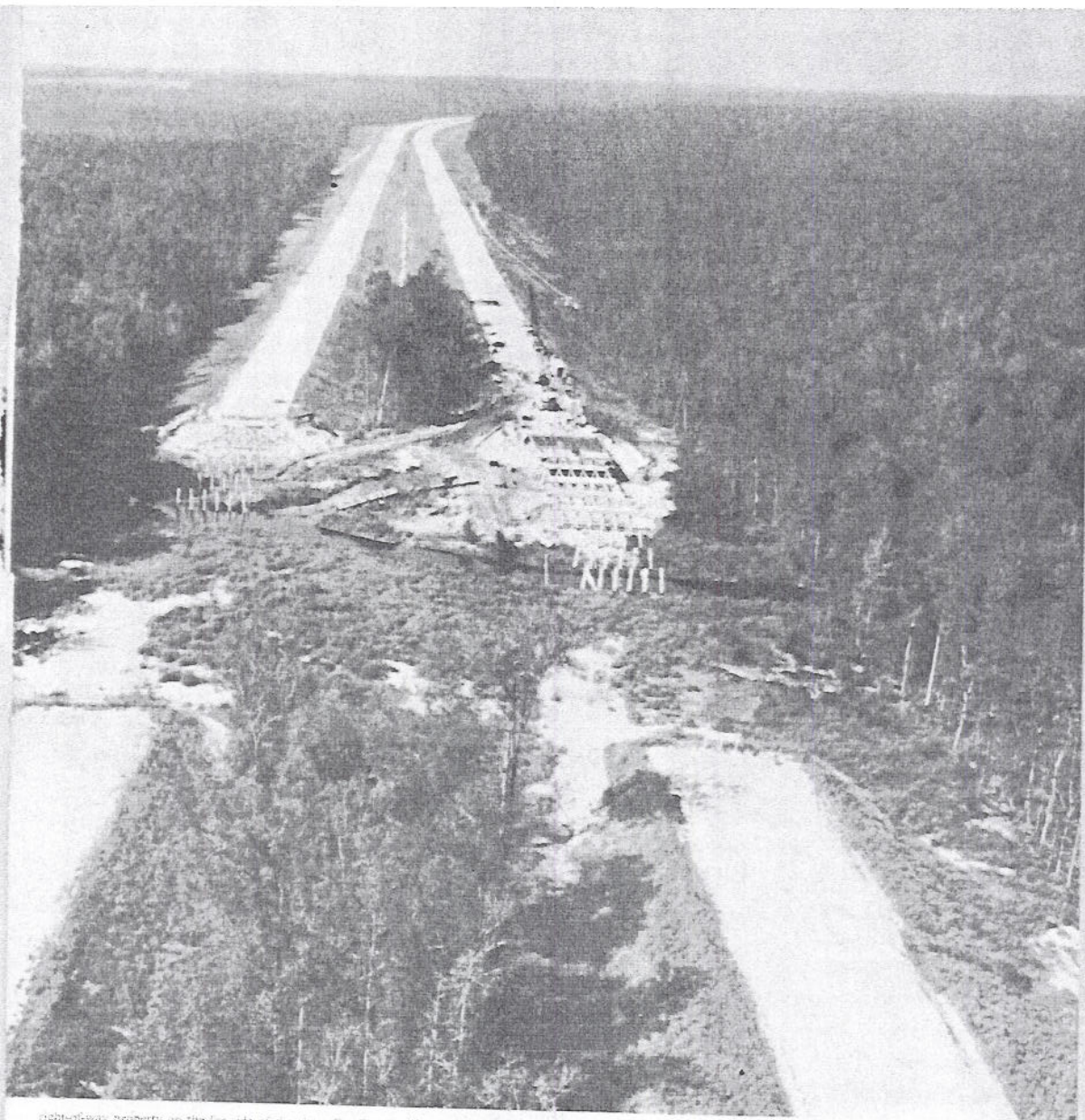
right-of-way property on the far side of the river. For Senator Thurmond's land, shown in the foreground, the price was $492 an acre.

"A man in public office has got to appear to be right as well as he is right," Senator Thurmond is debate on the matter of Mr. Justice Douglas' outside earnings, June 9, 1969.