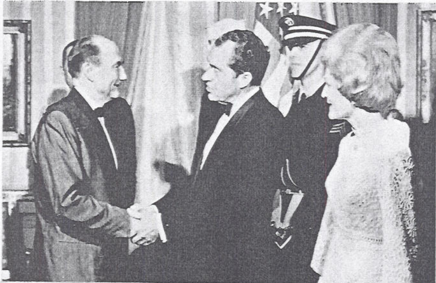
At a congressional reception last March, the senior senator from South Carolina was warmly greeted by President and Mrs. Nixon.