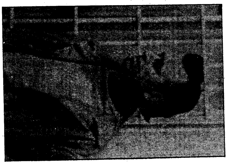
James Earl Ray