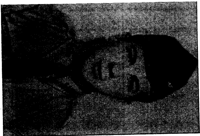
Lee Harvey Oswald