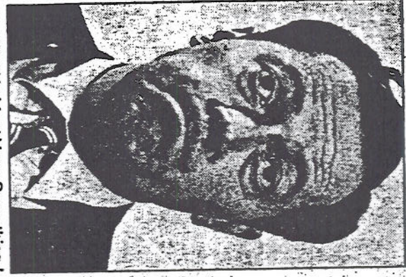
Clay Shaw, left, and Jim Garrison square off in 'He Must Have Something,' a documentary about Shaw's trial on charges he conspired to kill John F. Kennedy. The show airs tonight at 7 on LPB.

Finally, a courageous filmmaker has come forth to challenge the powerful men lying about the assassination of John F. Kennedy. No, I'm not talking about "JFK" director Oliver Stone, a man who seeks the truth by guessing a lot and crossing his fingers.