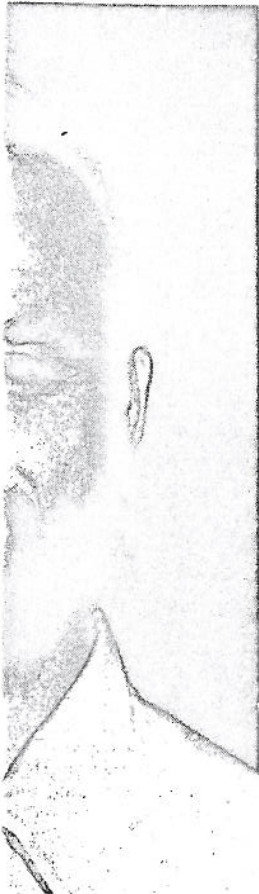
10

conspiratorial aspects: The House Committee on assassinations has concluded there was a conspiracy, and major reason was the acoustics: There was a tape, inadvertently made of the shots in the Plaza, when a motorcycle policeman left the microphone on radio locked on, and from the experts in the field of acoustics have proven that there were four shots fired, as opposed to the three shots the Warren Commission said there were. And it proved that the third shot came from the front, the opposite direction of Oswald, who was reportedly situated to the rear of