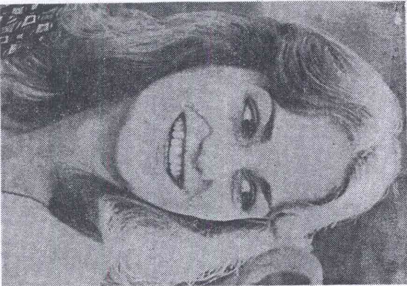
PATRICIA HEARST, THE KIDNAPED HEIRESS 'Mom, Dad. I'm OK' her taped message began

"And I want to get out of here but the only way I'm going to is if we do it their way. And I just hope that