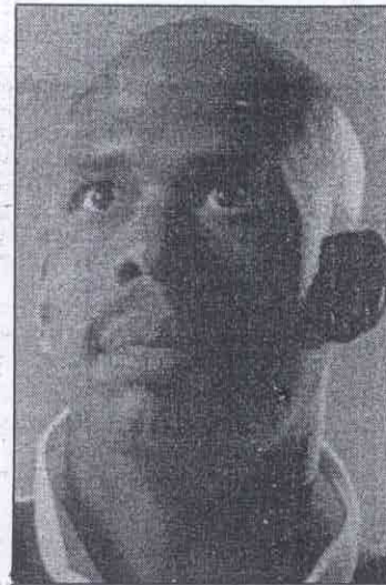
Kareem Abdul-Jabbar Serious about acting