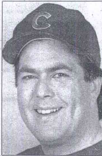
Kevin Meany "Uncle Buck" star