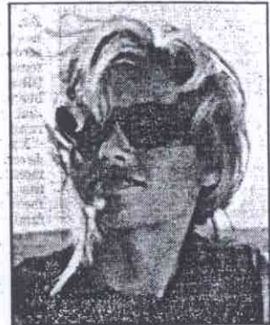
Geena Davis She's terrific; movie's ridiculous.

tifies armed robbery, manslaughter and chronic drunken-driving as exercises in consciousness-raising. It glorifies suicide. And it is so degrading to men, with pathetic stereotypes of testosterone-crazed behavior, that Loews Theaters should ban it immediately for the same twisted reasons the chain refused to show Andrew Dice Clay's "Dice Rules."