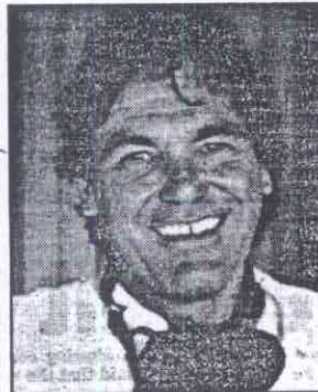
Oliver Stone Keep Posted on the latest feud.