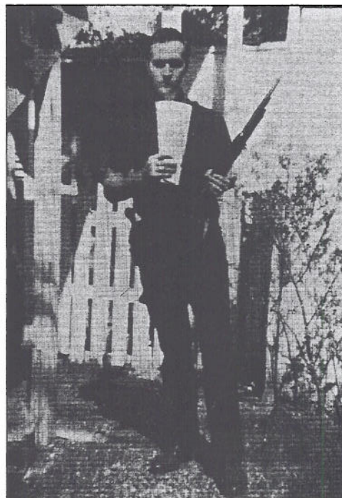
The retouched photo of actor Gary Oldman portraying Lee Harvey Oswald, as seen in JFK.

1. Mr. Stone has a member of New Orleans District Attorney Jim Garrison's staff claim that the famous still of Lee Harvey Oswald (holding a rifle similar to the one found in the book depository) was probably a fake photo because shadows cast by the sun are not evident in it. Then he creates a retouched photo of actor