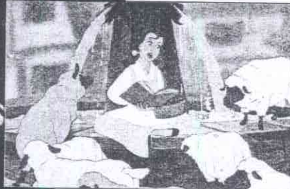
Enchanted Belle in "Beauty and the Beast"

"Bugsy" rates a 10 Beatty epic leads the Oscar mob