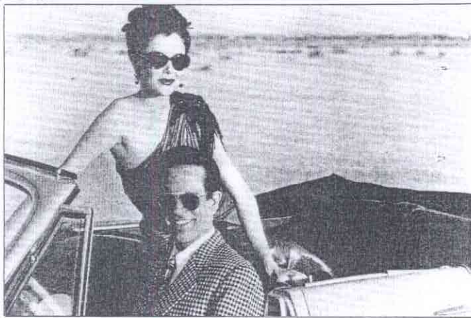
Warren Beatty, who was nominated for Best Actor, and Annette Bening, who did not receive an Oscar nomination, starred in "Bugsy," which is in the running for the Best Picture award.

pack with 10 nominations and won a Golden Globe, but it is the least successful film of the five nominees at the box office, and the academy does pay attention to that. "Beauty and the