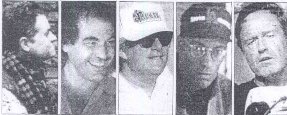
Jonathan Demme "The Silence of the Lambs" Oliver Stone "JFK" Barry Levinson "Bugsy" John Singleton "Boyz N the Hood" Ridley Scott "Thelma & Louise"

Nominees: Jonathan Demme for "The Silence of the Lambs" (first nomination); Barry Levinson for "Bugsy" (second directing nomination, sixth overall; he won in 1988 for "Rain Man"); Ridley Scott for "Thelma & Louise" (first nomination); John Singleton for "Boyz N the Hood" (first nomination); Oliver Stone for "JFK" (third directing nomination, 10th overall; won for "Platoon" in 1986 and "Born on the Fourth of July" in 1989, and for Best Original Screenplay for "Midnight Express" in 1978).