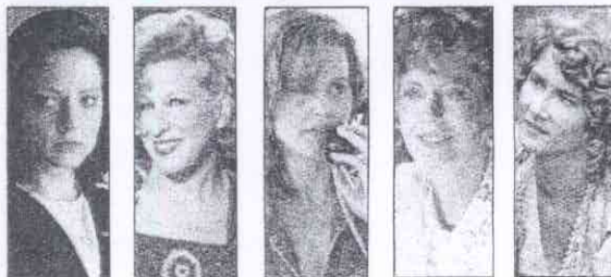
Foster "Silence of the Lambs" Midler "For the Boys" Davis "Thelma & Louise" Sarandon "Thelma & Louise" Dern "Rambling Rose"

Nominees: Geena Davis for "Thelma & Louise" (second nomination, won Best Supporting Actress for "The Accidental Tourist" in 1988); Laura Dern for "Rambling Rose" (first nomination); Jodie Foster for "The Silence of the Lambs" (third nomination, won Best Actress in 1988 for "The Accused"); Bette Midler for "For the Boys" (second nomination); Susan Sarandon for "Thelma & Louise" (second nomination).