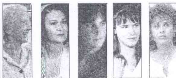
Tandy "Fried Green Tomatoes" Ladd "Rambling Rose" Ruehl "The Fisher King" Lewis "Cape Fear" Nelligan "Prince of Tides"

Nominees: Diane Ladd for "Rambling Rose" (third nomination); Juliette Lewis for "Cape Fear" (first nomination); Kate Nelligan for "The Prince of Tides" (first nomination); Mercedes Ruehl for "The Fisher King" (first nomination); Jessica Tandy for "Fried Green Tomatoes" (second nomination, won Best Actress Oscar in 1989 for "Driving Miss Daisy").