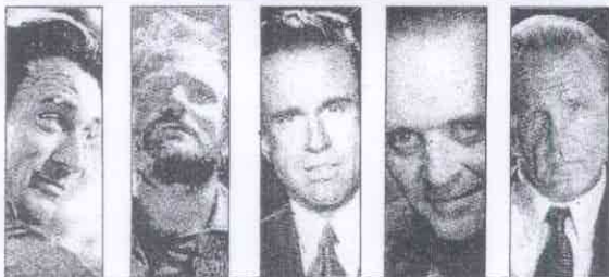
De Niro "Cape Fear" Williams "The Fisher King" Beatty "Bugsy" Hopkins "Silence of the Lambs" Nolte "Prince of Tides"

Nominees: Warren Beatty for "Bugsy" (fourth acting nomination, 12th overall; won Best Director Oscar in 1981 for "Reds"); Robert De Niro for "Cape Fear" (sixth nomination, won Best Supporting Actor in 1974 for "The Godfather Part II" and Best Actor in 1980 for "Raging Bull"); Anthony Hopkins for "The Silence of the Lambs" (first nomination); Nick Nolte for "The Prince of Tides" (first nomination); Robin Williams for "The Fisher King" (third nomination).