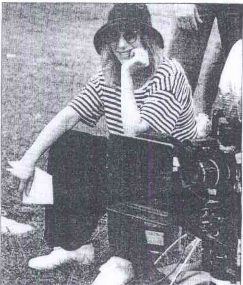
Was it pure sexism that kept Barbra Streisand from being nominated for a directing Oscar for "Prince of Tides"?

The last time a director was so unceremoniously Streisanded for a film that garnered oodles of other nominations was two years ago, when they forgot that Bruce Beresford must have had some hand in Best Picture winner "Driving Miss Daisy's" success. But the more germane comparison with the current competition is the 1985 race, when Steven Spielberg was ignored for his laughable, but otherwise multino-