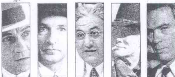
Keitel "Bugsy" Kingsley "Bugsy" Lerner "Barton Fink" Palance "City Slickers" Jones "JFK"

Nominees: Tommy Lee Jones for "JFK" (first nomination); Harvey Keitel for "Bugsy" (first nomination); Ben Kingsley for "Bugsy" (second nomination, won Best Actor in 1982 for "Gandhi"); Michael Lerner for "Barton Fink" (first nomination); Jack Palance for "City Slickers" (third nomination).