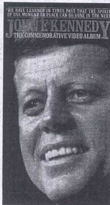
"Who Didn't Kill JFK" argues that pictures of Oswald were doctored; "The Video Album" offers Rose Kennedy reminiscing about J.F.K.