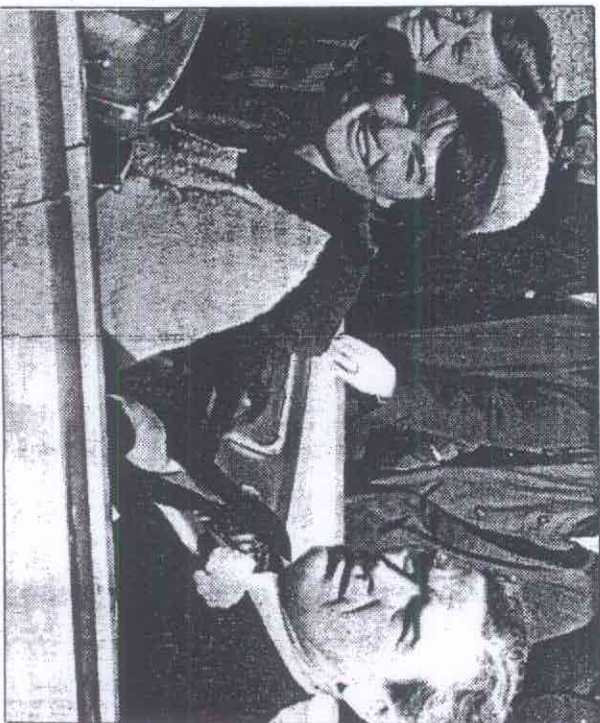
President and Mrs. Kennedy and Texas Gov. John Connally on the fateful day in 1963. A cottage industry becomes a conglomerate.

with "A Closer Look," followed that evening with the syndicated series "Inside Edition," the CBS series "JFK: The Untold Story." Please see KENNEDY, F24