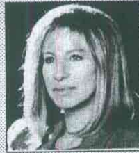
Barbra Streisand "The Prince of Tides" Opened Dec. 25 Gross: $52 million First DGA nom