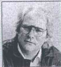
Barry Levinson "Bugsy" Opened Dec. 13 Gross: $36.7 million Third DGA nom