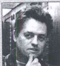
Jonathan Demme "The Silence of the Lambs" Opened Feb. 14, 1991 Gross: $130.7 million First DGA nom