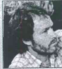
Ridley Scott "Thelma & Louise" Opened May 24 Gross: $44.7 million First DGA nom