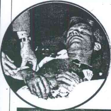
The assassination of Ted Kennedy would have been the final nail in the coffin of the Kennedy dynasty. The first blow was the killing of President John F. Kennedy, allegedly by Lee Harvey Oswald.