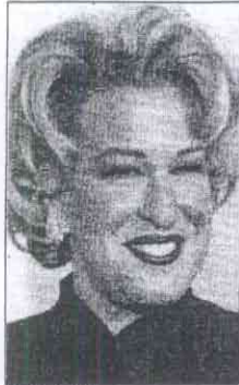
Bette Midler "For the Boys"

Bergen, commenting on her fortysomething, single character's decision to have a child, said, "We go to great pains not to portray it