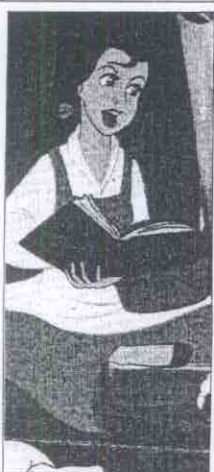
"Beauty and the Beast" garnered three awards.