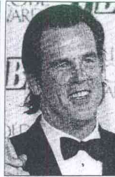
Nick Nolte "The Prince of Tides"