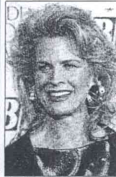
Candice Bergen "Murphy Brown"