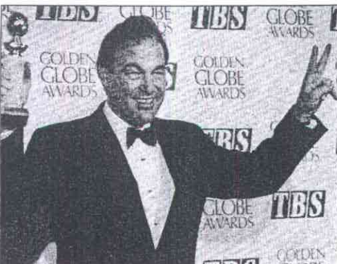
Oliver Stone won the best director honor for "JFK."