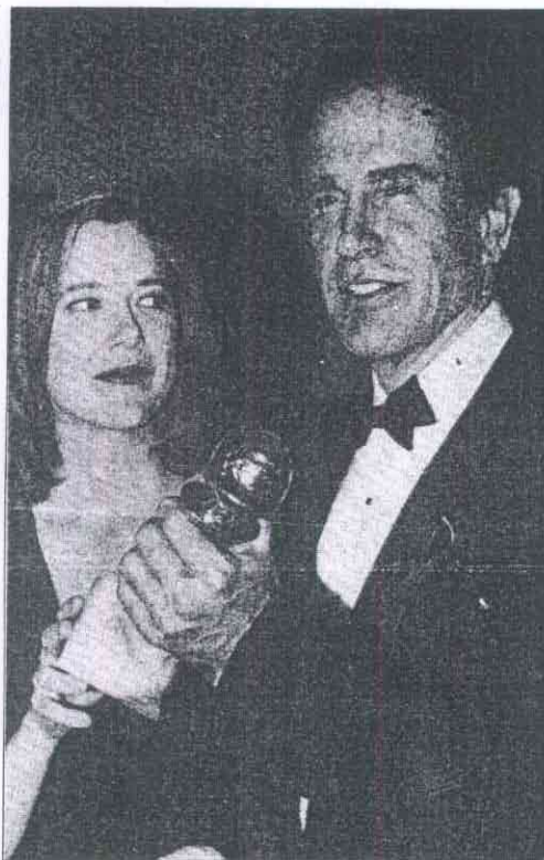
Annette Bening and Warren Beatty take a break from their new baby to celebrate "Bugsy's" award for best film.