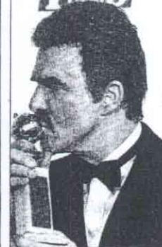
Burt Reynolds "Evening Shade"