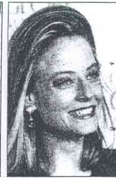
Jodie Foster "The Silence of the Lambs"

as a problem-free pregnancy or a problem-free choice."