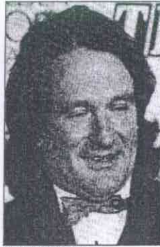
Robin Williams "The Fisher King"