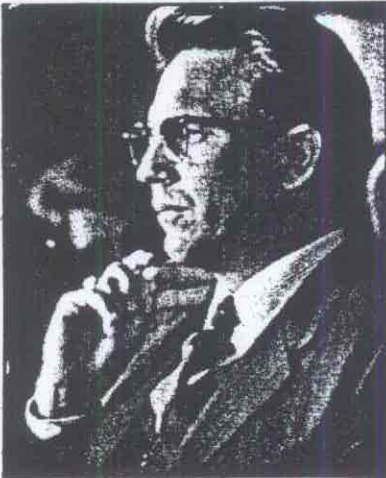
Kevin Costner as New Orleans DA Jim Garrison in "JFK."