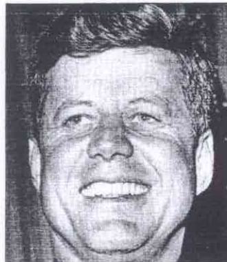
John F. Kennedy

Barry Levinson's 'Bugsy' isn't a true account of Benjamin Siegel's exploits. Oliver Stone took history, gave it a big shake, and out came 'JFK.' Stone takes the heat, Levinson doesn't. Sure, there's a big difference between a gangster's tale and the assassination of a President, but the issue here is 'history' vs. artistic license. In the end, it all boils down to trust and the question . . .