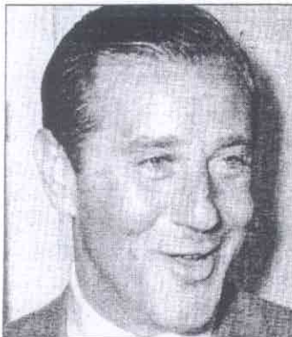
Benjamin (Bugsy) Siegel

Barry Levinson's 'Bugsy' isn't a true account of Benjamin Siegel's exploits. Oliver Stone took history, gave it a big shake, and out came 'JFK.' Stone takes the heat, Levinson doesn't. Sure, there's a big difference between a gangster's tale and the assassination of a President, but the issue here is 'history' vs. artistic license. In the end, it all boils down to trust and the question . . .