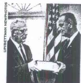
Lyndon Johnson receiving the "Warren Commission Report" from Earl Warren