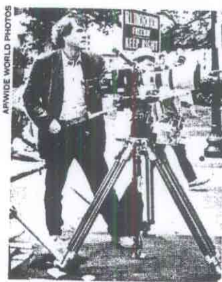
Stone setting up the fatal motorcade