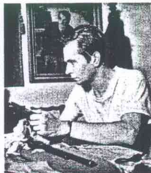
Center: Mug shot of the real Lee Harvey Oswald. Above: Gary Oldman as Oswald

his lines ver- batim from tran- scripts and news footage.