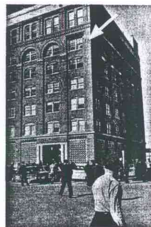
Did the shots come only from this building? The Warren Commission says yes, but many—including the House Select Committee on Assassinations, Garrison, and Stone—say no.

Kennedy knew that with a 1964 re-election victory, he could move forcefully to end the Cold War.