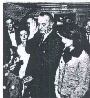
Lyndon Baines Johnson, with Jacqueline Kennedy, being sworn in as the 36th president of the United States. Under his administration, the U.S. escalated the Vietnam War.